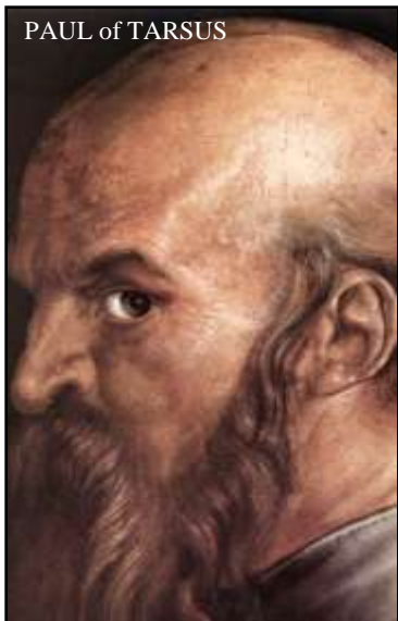
PAUL of TARSUS

equality of everyone (not to mention the rituals the early Christians developed, Communion, etc.) gained it attention all over the Empire. The Roman Empire’s reach allowed for easy travel across its great size for the missionaries. They even went beyond to Axum, Persia, and Ethiopia. As the Empire fell, people turned to this new religion for comfort/spiritual solace.